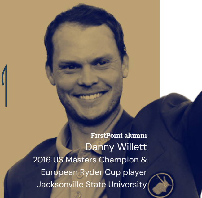
FirstPoint alumni Danny Willett 2016 US Masters Champion & European Ryder Cup player Jacksonville State University